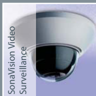
SonaVision Video Surveillance